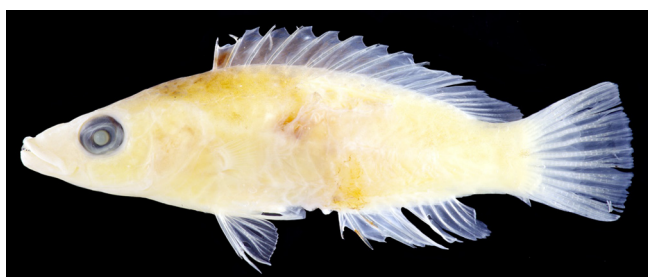
Figure 3. – Preserved specimen of Oxycheilinus samurai from Payo Bay, Halmahera, Indonesia (WAM P. 32973-003, 46.3 mm SL).