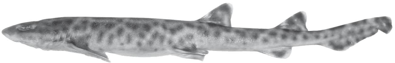
Figure 2. - Lateral view of Atelomycterus baliensis sp. nov., fresh non-type specimen (MZB 12901). [ Vue latérale de Atelomycterus baliensis sp. nov., spécimen frais, non-type.]

72/63 rows; 5/4 series functional; posterolateral teeth not arranged in diagonal files; no toothless spaces at symphysis; not strongly differentiated in upper and lower jaws, medials, anterolaterals and posteriors in both jaws weakly defined. Tooth formula (N = 1) is: \frac{36}{32} \frac{3}{3} \frac{36}{31}