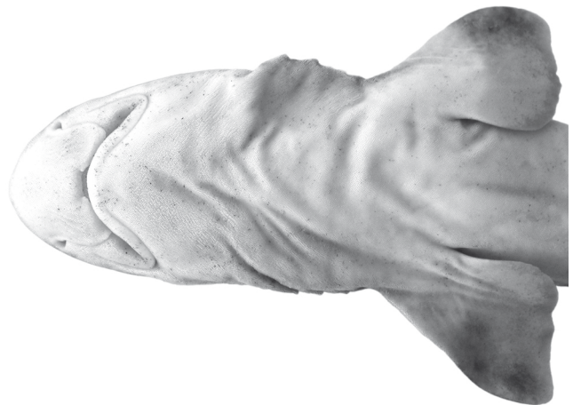
Figure 3. - Ventral head view of Atelomycterus baliensis sp. nov., holotype adult male, 433 mm TL (CSIRO H 5868-03). [ Vue ventrale de la tête de Atelomycterus baliensis sp. nov., holotype mâle adulte.]

Teeth tricuspid (Fig. 4); central cusp typically pungent, much longer than lateral cusps; cusps strongly erect to semi-oblique, more erect posteriorly; upper anterior symphyseal teeth smaller than those adjacent; posterior teeth with low central cusps, in several rows in both jaws, distinctly smaller than anterior teeth; sexual heterodonty weak, median cusps relatively thicker distally in adult males. Body slender, trunk subcircular in section at first dorsal base; length of trunk from fifth gill openings to vent 1.24 (1.19-1.21) times head length; no predorsal, interdorsal or postdorsal ridges on midline of back; no postnatal ridge between anal fin base and lower caudal fin origin; no lateral ridges. Caudal peduncle short, moderately compressed, without lateral keels; height 1.32 (1.46-1.82) in width at second dorsal fin insertion, 1.76 (1.61-1.78) in dorsal-caudal space. Lateral trunk denticles below first dorsal fin narrow, weakly tricuspid, teardrop-shaped (Fig. 5); crowns with pair of strong medial ridges extending entire length onto long, narrow