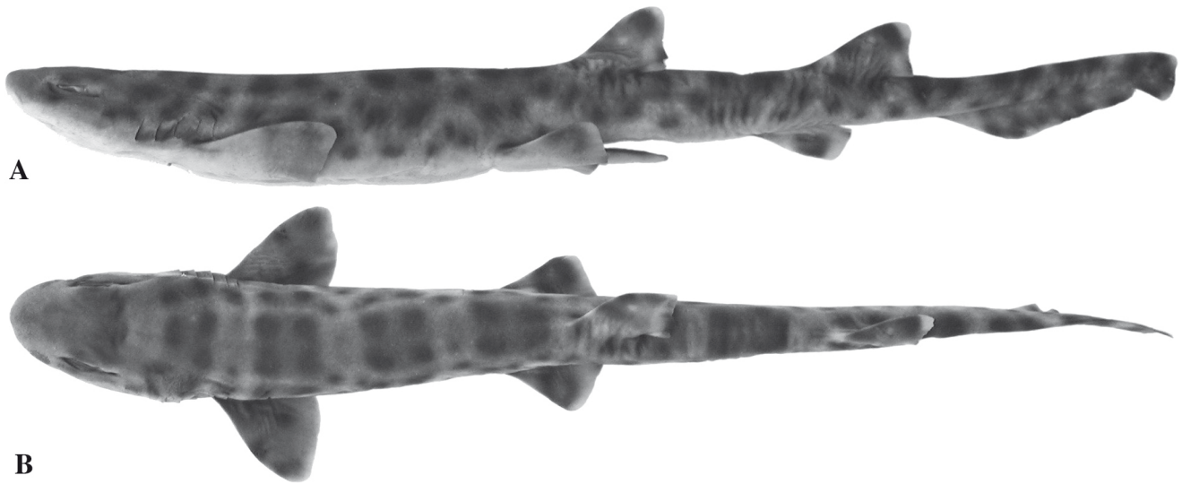
Figure 1. - Atelomycterus baliensis sp. nov., holotype adult male, 433 mm TL (CSIRO H 5868-03). A : Lateral view; B : Dorsal view. [ Atelomycterus baliensis sp. nov., holotype mâle adulte. A : Vue latérale ; B : Vue dorsale.]